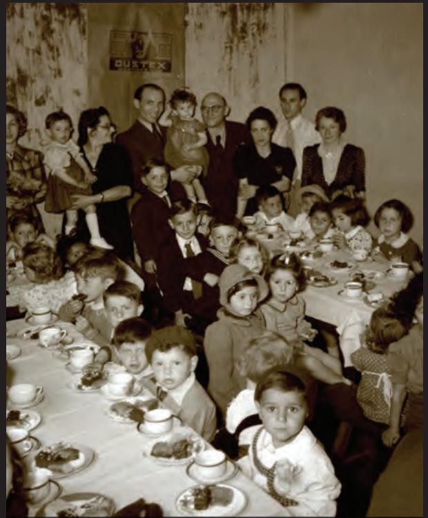
Jewish children gathering, Shanghai, China