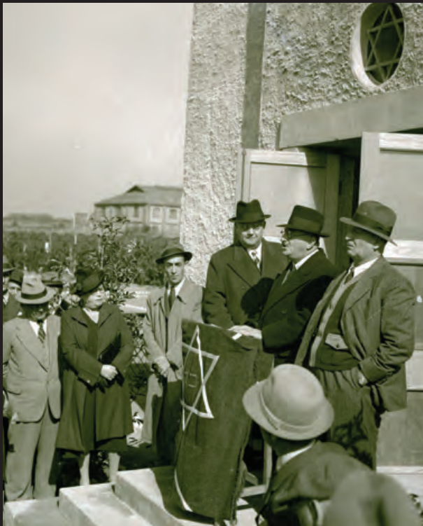
Jewish temple, Shanghai, China