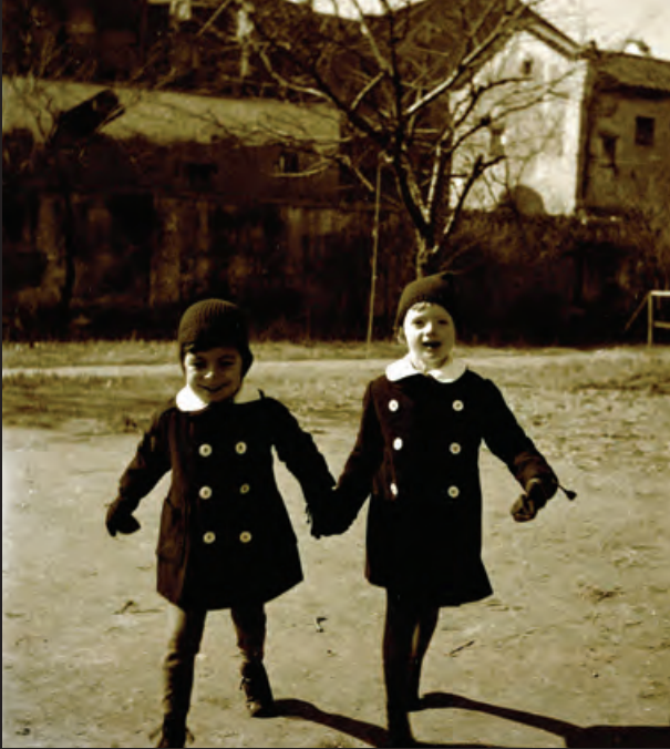
Jewish kindergarten, Shanghai, China