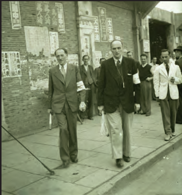
Jewish men with armbands outside of a building, Shanghai, China