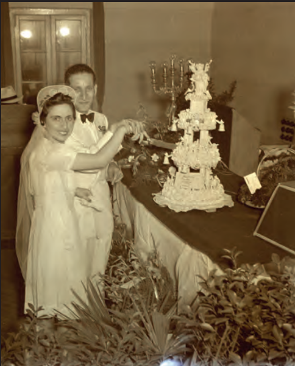
Jewish wedding, Shanghai, China