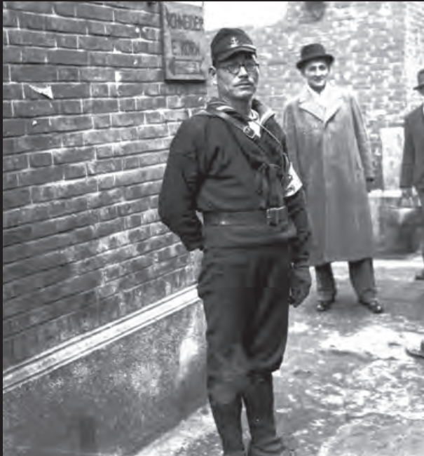
Japanese soldier in navy uniform with an armband, Shanghai, China