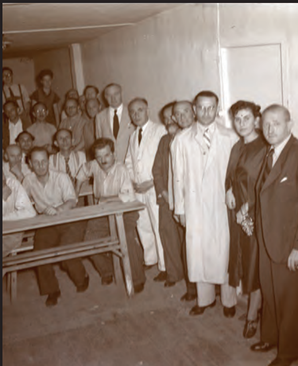
Jewish group portrait, Shanghai, China

Recently, the William H. Hannon Library ( http://library.lmu.edu/ ) launched the Werner von Boltenstern Shanghai Photograph and Negative Collection, which contains, most notably, images of Jewish Holocaust refugees and other Jewish communities already living in Shanghai in the 1930s-1940s. From daily work life to weddings to soccer games in ghettos, these images capture a wide range of the Jewish experience as well as show the deep imprint Jewish culture has had on Shanghai's history.