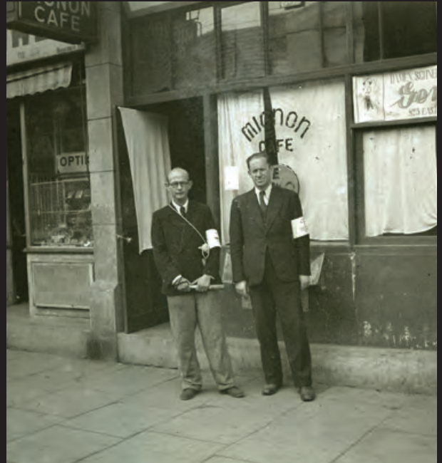
Jewish men wearing armbands in front of Monon Cafe on East Seward Road, Shanghai, China