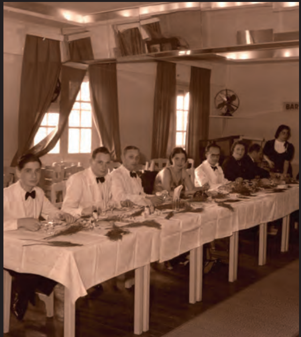
Jewish wedding, Shanghai, China