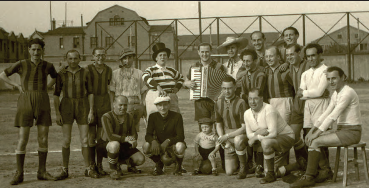
Jewish community soccer game, Shanghai, China