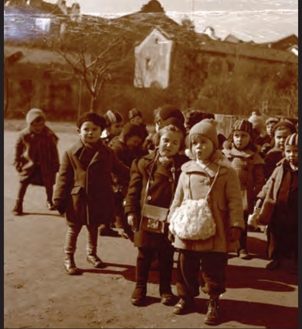
Jewish kindergarten, Shanghai, China