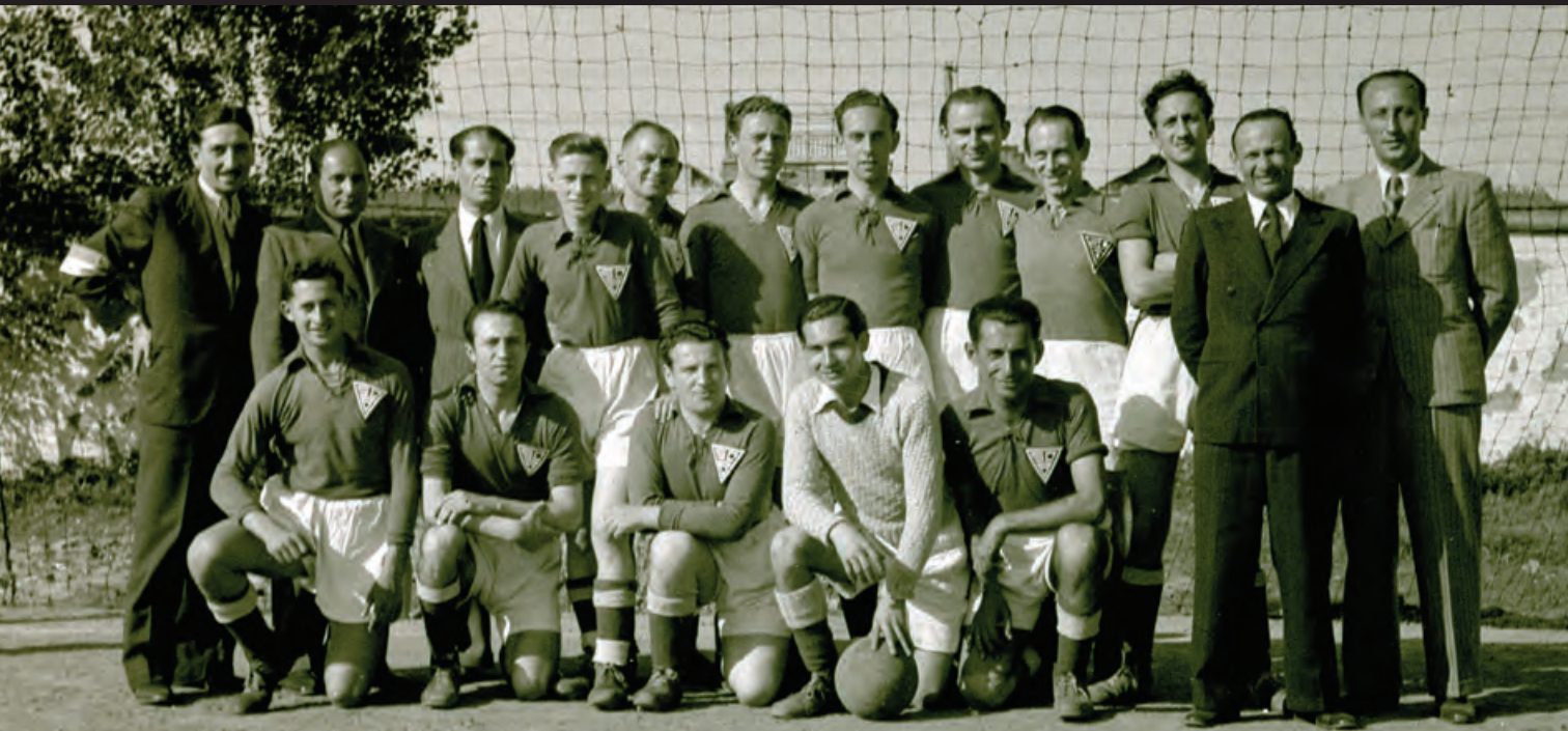
Jewish community soccer game, Shanghai, China